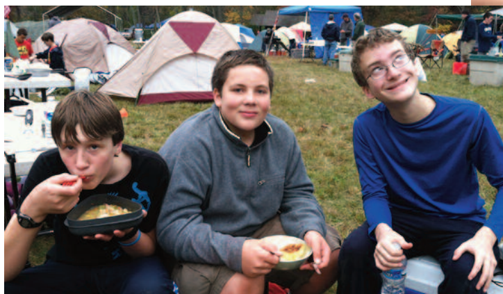
Both Patrols chose to make Hearty Chicken Noodle Soup. One patrol made foil packet biscuits. The boys practiced good knife skills and really enjoyed a delicious hot meal they made themselves.